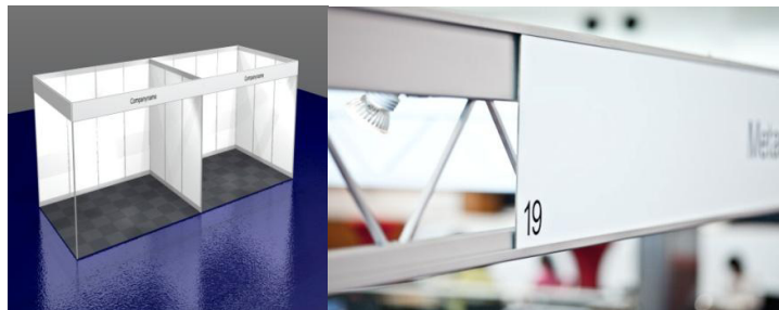
Photo impression shell scheme. Other options are possible.